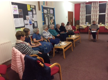
Verse of the vear for 2019

It is the Lord who goes before you. He will be with you; He will not leave you or forsake you. Do not fear or be dismayed. Deuteronomy 31:8