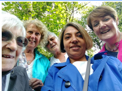
CAMEO Visit to Longton Nature Reserve