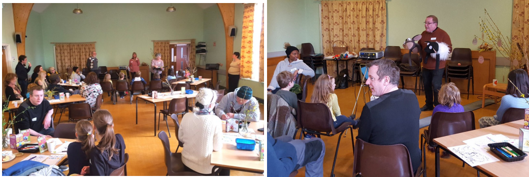
Café Church with Holy Trinity