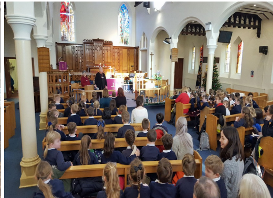
An enjoyable morning with a visit from Norwood Road School