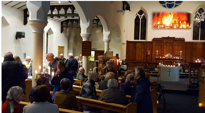
Carols by Candlelight Service to mark the end of year.